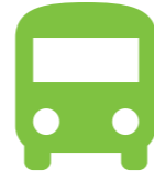
Heavy duty vehicles

Heraeus focuses on Fuel Cell catalysts for E-mobility and offers three catalysts which are most suitable for passenger vehicles and heavy-duty vehicles applications.