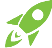
Unmanned Aerial Vehicles