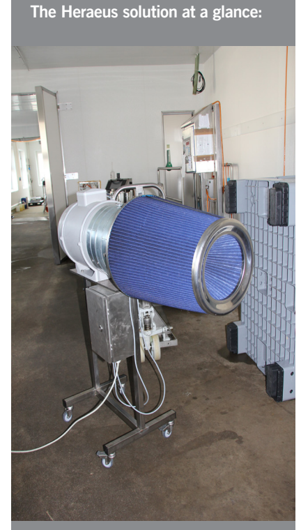
Ozone-free lamps with 254nm UV emission, control unit with 200 W energy consumption and precisely fitting clamping springs.

"In the end, you want a solution that reliably and lastingly disinfects the air," says Wiegand. "It should be long-living and, what is even more important: maintenance should not cause production standstills."