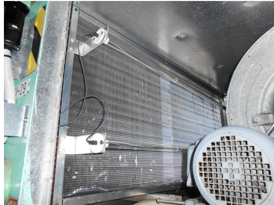
HVAC Air Handling Unit after UVC installation