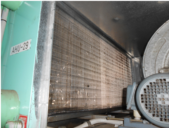
HVAC Air Handling Unit before UVC installation

After just 3 months of operation, CAD units delivered a minimum of 20 % improvement in airflow, heat transfer and energy savings. Furthermore, IAQ (Indoor Air Quality) improved dramatically and eliminated manual duct and coil cleaning. The CAD lamps provide a very high UVC output and are maintenance free. Beyond Energy Solutions provided an innovative UV solution with a short return on investment - with multiple benefits for their client.