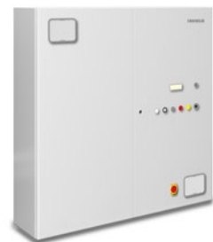
Air D Control